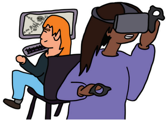
VR: virtual reality.

Figure 1. Illustrating a person wearing headmounted display (HMD) and hand-controllers in a virtual environment